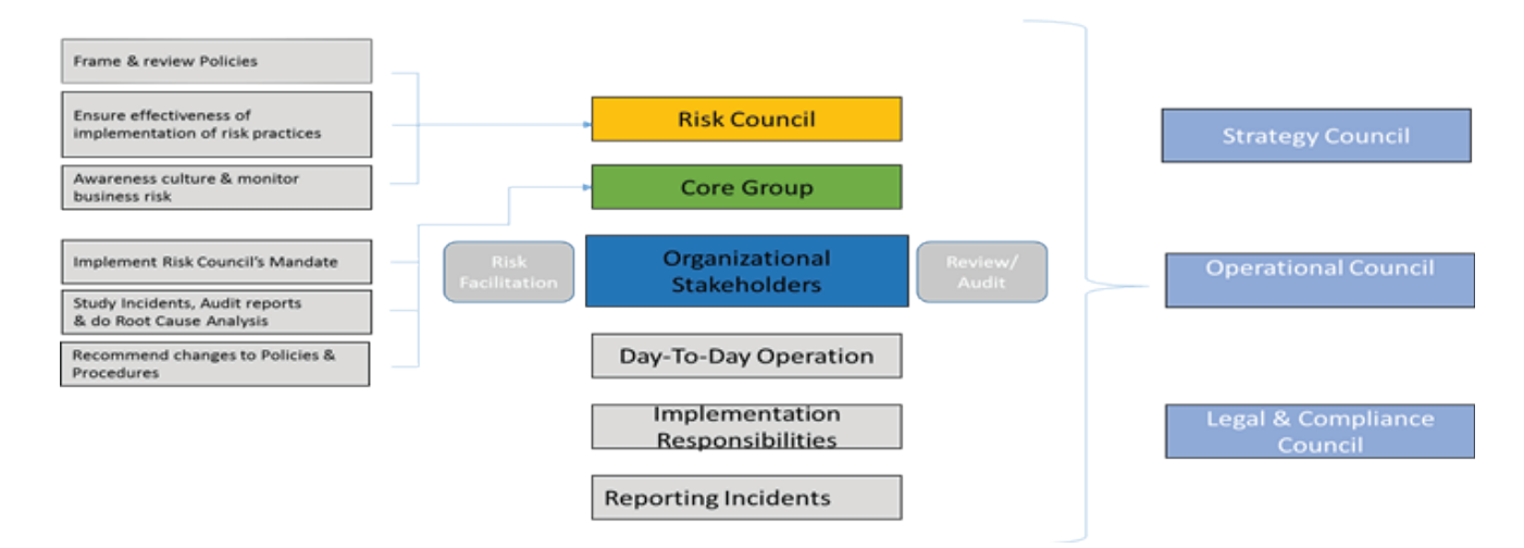
Infosys BPO Risk Governance flow to Group level Infosys Risk Management Framework

The day-to-day implementation of the risk management steps are undertaken at each facility by respective functional teams for each location and their implementation are overseen at the organization level by a Risk Management Core Group comprising of various functional heads and integrates with the Group level Infosys Risk Management Framework as shown in the following diagram.