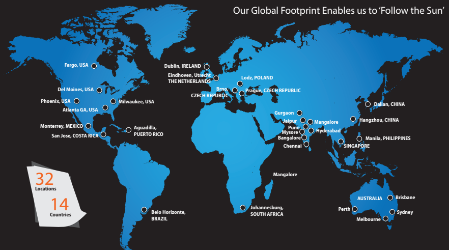
Our Global Footprint Enables us to 'Follow the Sun'